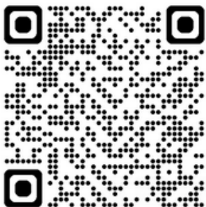
QR Code to the Percy Agricultural Society home page:

PAS has created a Legacy Fund, with a vision to Honour our Past and Embrace the Future. This fund will ensure a living legacy to help preserve and enhance our fairgrounds and buildings for generations to come. If you would like to assist in this initiative, please consider making a donation to Percy Agricultural Society/Legacy Fund.